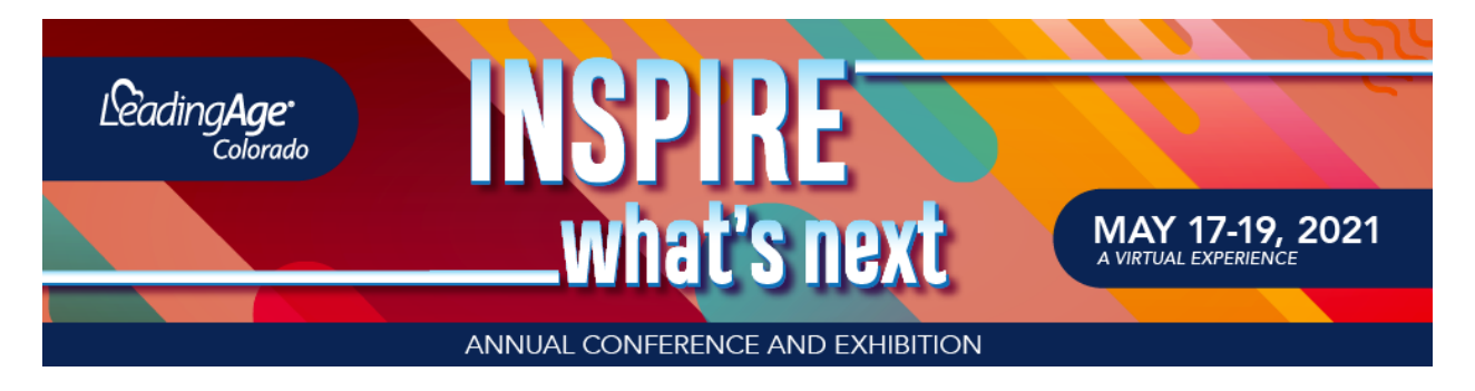
Exhibit and Sponsor Opportunities

We may not be able to gather in person, but your company can still connect with customers and leads at the 2021 LeadingAge Colorado Annual Conference and Exhibition !